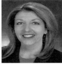
Owned And Operated By NRT Incorporated.