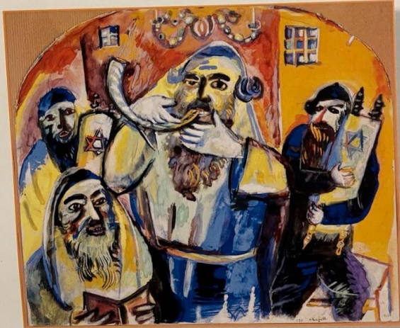
Marc Chagall, The Shofar

MAY YOUR NEW YEAR BE HAPPY, HEALTHY AND SWEET !